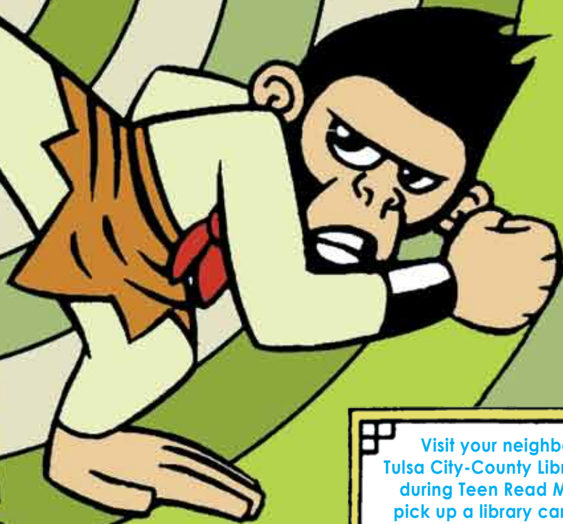
Artwork by Gene Luen Yang

While numerous libraries across the nation have experienced a decline in teen usage, Tulsa City-County Library has seen a steady influx of teens coming into the library.