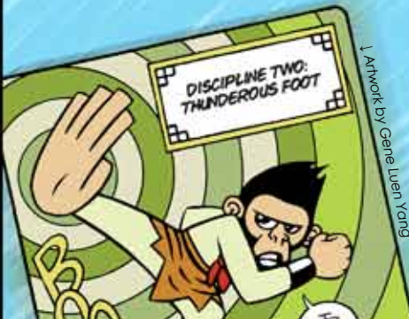
Artwork by Gene Luen Yang