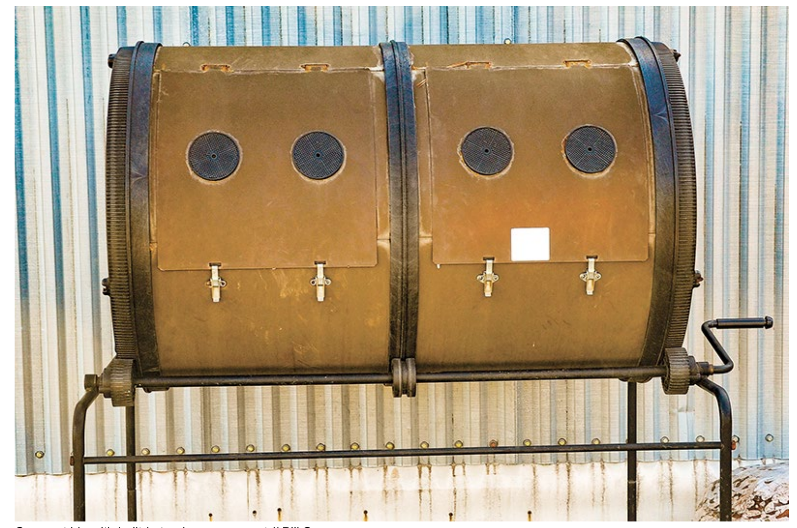
Compost bin with built-in turning component // Bill Sever