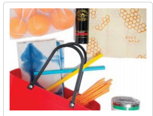
Green shopping guide

Saving money for the future and having a nest egg ready may sound unrealistic, but the truth is, it's not as difficult as it sounds.