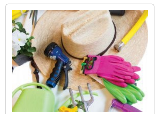
Stylish must-haves for your springtime garden

April showers are sure to bring May flowers with these tools of the trade.