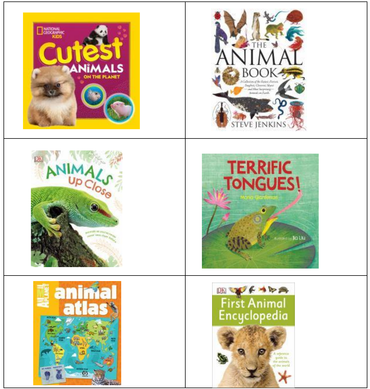
Tulsa City-County Library Lesson Plan: 2021 Summer Reading Program, "Tails & Tales"/Animals

Search the library's catalog (tccl.bibliocommons.com) for "Animals - Juvenile Literature" or use this list to find anthologies: