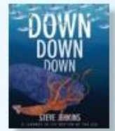
Down, Down, Down: A Journey to the Bottom of the Sea by Steve Jenkins • Awesome illustrations bring this informative nonfiction book to life.