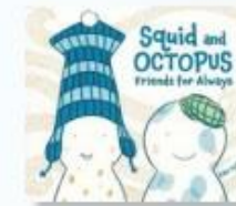
Squid and Octopus: Friends for Always by Tao Nyeu • Cute and colorful! This picture book is equal parts silly and wholesome.