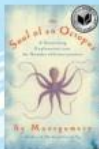
The Soul of an Octopus by Sy Montgomery