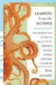
Learning From the Octopus by Rafe Sagarin